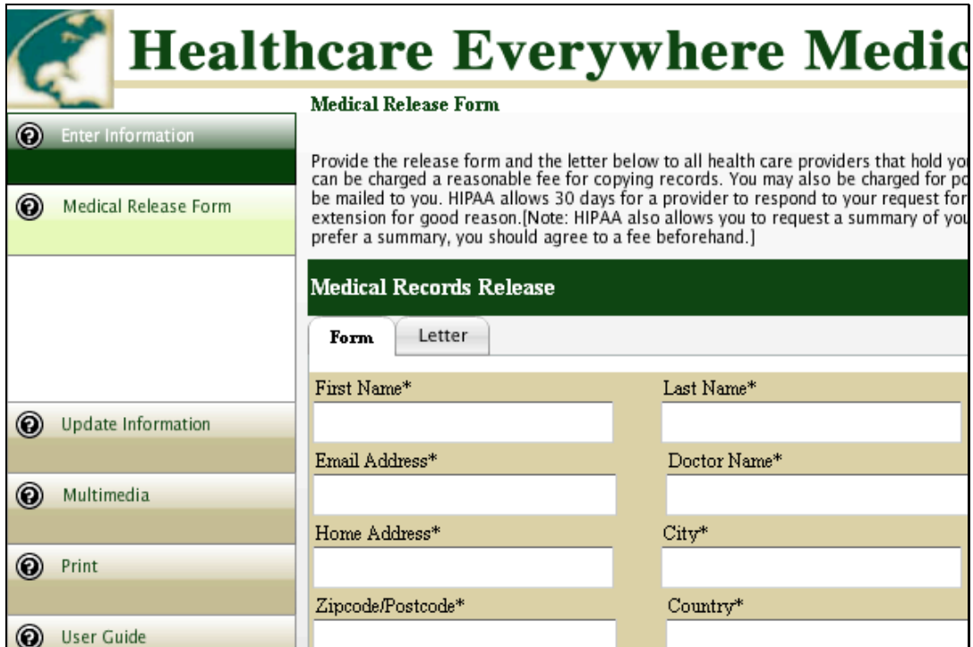
Slide 1 Text Captions: Clicking the "?" will display information related to the associated section